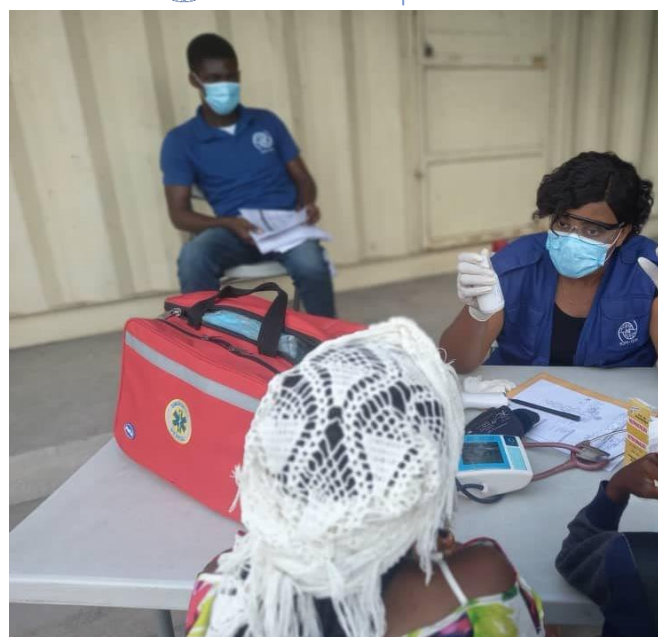
An IOM medical doctor conducts a consultation with returnees at the Toussaint Louverture International Airport in Port-au-Prince (© IOM Haiti, 07 Dec 2021).