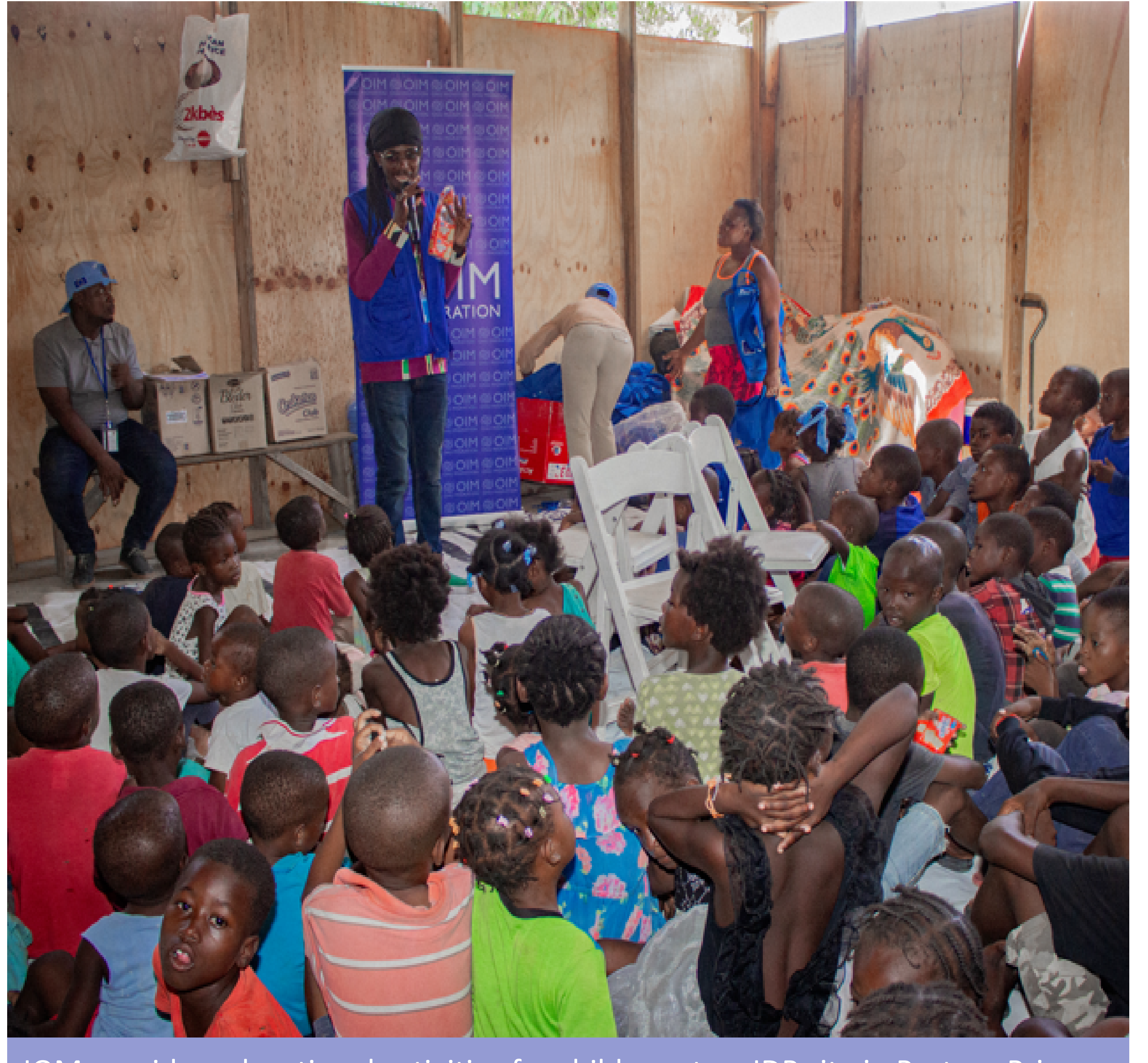
IOM provides educational activities for children at an IDP site in Port-au-Prince