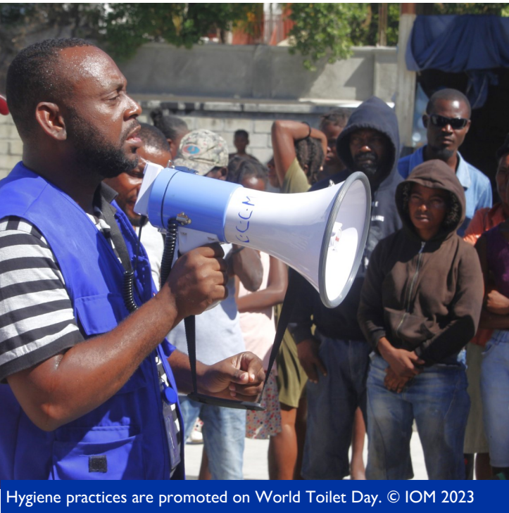
Hygiene practices are promoted on World Toilet Day.