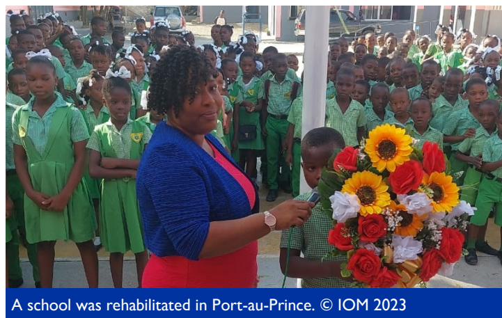
A school was rehabilitated in Port-au-Prince.

As part of the efforts to strengthen binational dialogue with the Dominican Republic, IOM enabled the participation of two members of the bilateral joint commission in a workshop on conventions governing transnational waters held on November 8 and 9 in Budapest, Hungary. This allowed the Haitian delegation to have a working session with their Dominican counterparts thanks to a high-level meeting organized by the Hungarian Ministry of Foreign Affairs.