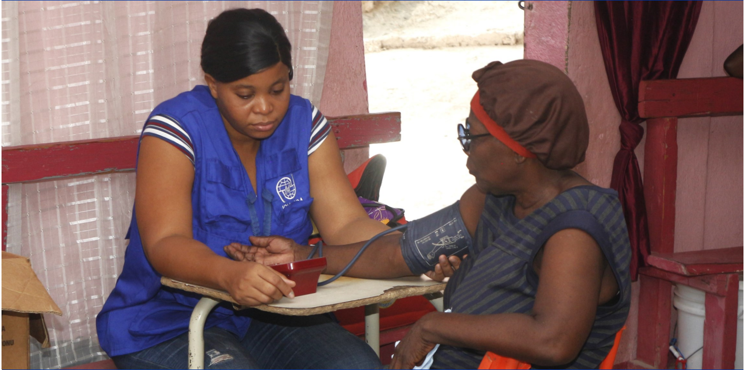
A medical consultation is taking place in the Delmas 65 site.