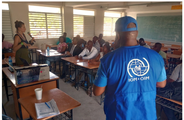
Training on mobility tracking in Desarmes, Artibonite department, 10 June 2023