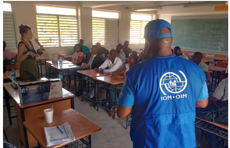
Training on mobility tracking in Desarmes, Artibonite department, 10 June 2023, © IOM 2023