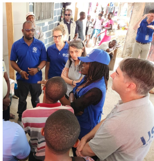
Visit with USAID to IDP sites in Port-au-Prince on 10 June