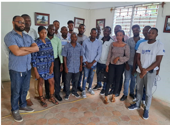
Training on mobility tracking in Hinche, Centre department, 15 June 2023, © IOM 2023

To support the flood response, DTM published an Emergency Tracking Tool report to locate populations displaced during the emergency event and to inform of the priority needs of the affected population.