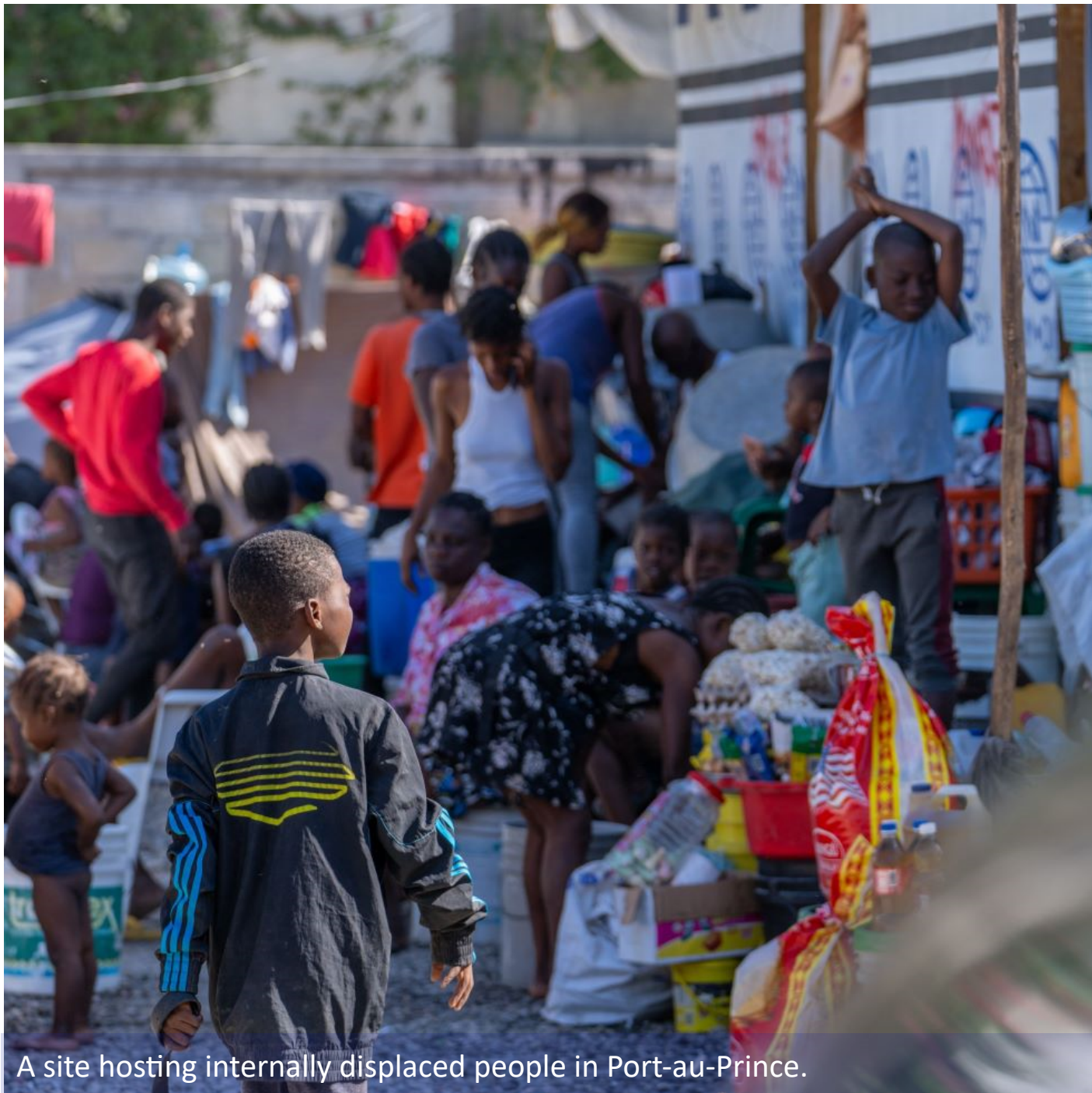
A site hosting internally displaced people in Port-au-Prince.